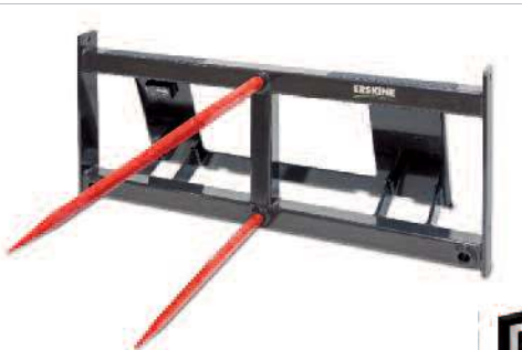
Round bale configuration shown here.

Prices, financing and specifications subject to change without notice.