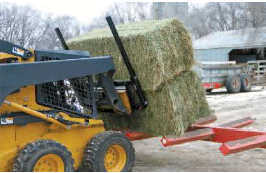
Optional stacking extensions shown here.

Our Bale Spear allows you to move and stack both round and large square bales easily and effectively.