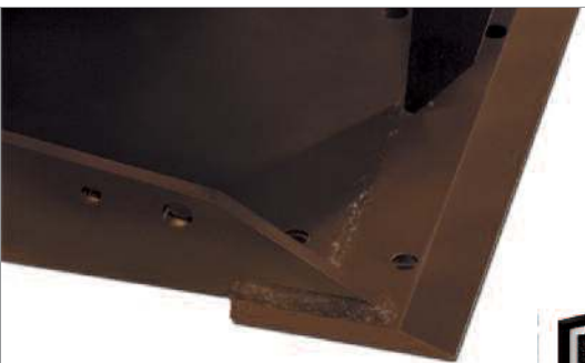
Heavy-duty cutting edge for scraping.