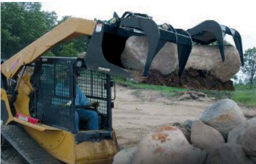
Independent grapples allow for uneven materials.

Reinforced grapple bucket is perfect demolition debris or clean-up work. The heavy-duty design allows the handling of odd-shaped material utilizing its heavy-duty tines and powerful independent dual grapples.