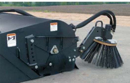
Shown with optional Curb Sweeper.