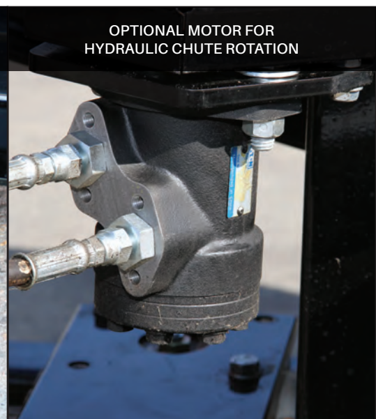
OPTIONAL MOTOR FOR HYDRAULIC CHUTE ROTATION