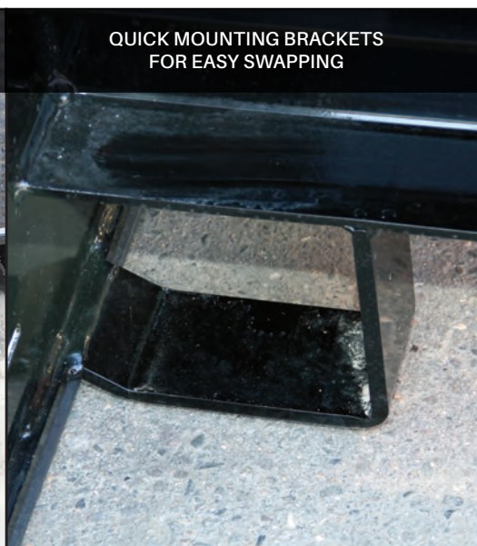
QUICK MOUNTING BRACKETS FOR EASY SWAPPING